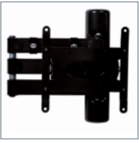
Space saving design - folds flat to the wall