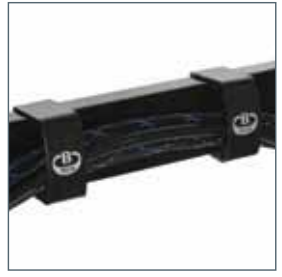
CLIP LOGIC<sup>™</sup> cable management