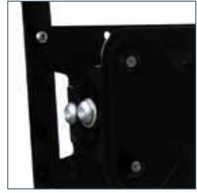
Security locking screws provided