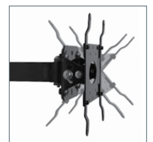
Easy adjustment of tilt