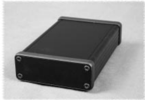
Black Anodized Version (Assembled View)