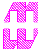
VIEW OF BASE (INSIDE)