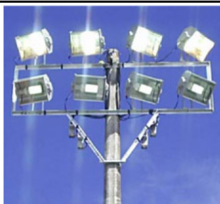
LED Street Light, SP90 in Brazil