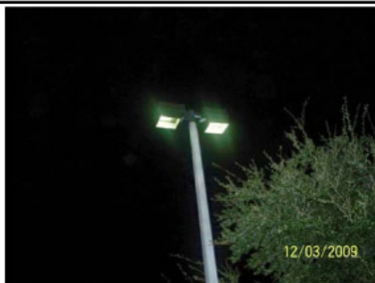
LED Street Light, SP90 in USA