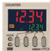
Light gray (sold separately)

Note: Black front panel is a replacement part.