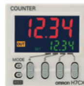
White (sold separately)