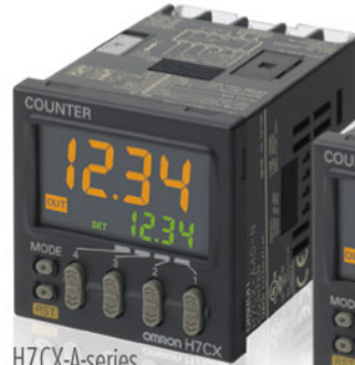
H7CX-A-series Multifunction Preset Counter with Four Digits