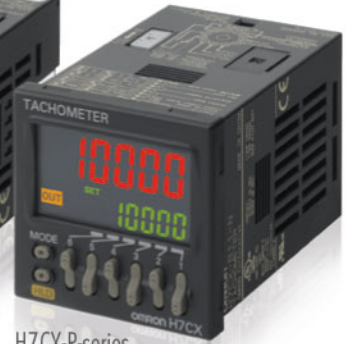
H7CX-R-series Digital Tachometer

Space-Saving 1/16 DIN Counters with All-in-One Functionality to Solve Most Counting and Positioning Applications