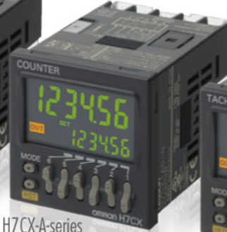
H7CX-A-series Multifunction Preset Counter with Six Digits