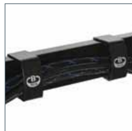
CLIPLOGIC™ cable management