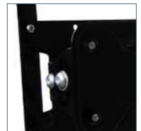
Security locking screws provided