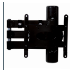
Space saving design - folds flat to the wall